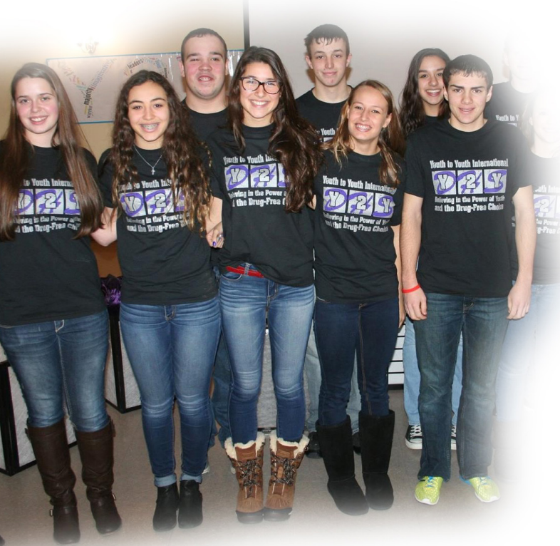
PFCS Youth Led Prevention members

PFCS, an OhioGuidestone Organization, has implemented a new Youth Led prevention program which focuses on drug prevention through youth leadership. By developing high school student's leadership skills, the program harnesses the influence of peer pressure to encourage young people to be positive influences in each other's lives. Currently in Carrollton and Dover High Schools, the program will also be implemented in Tuscarawas Valley Middle School and New Philadelphia High School this fall.