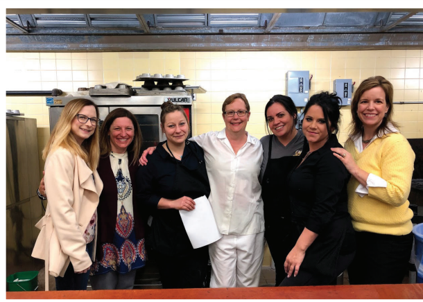
Believe in Dreams and Baldwin Wallace University have formed an amazing partnership to benefit the children at OhioGuidestone's Residential Treatment Center.