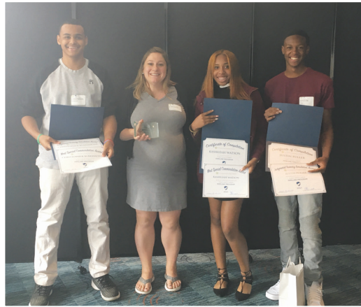
R Rules students receiving their certificates.