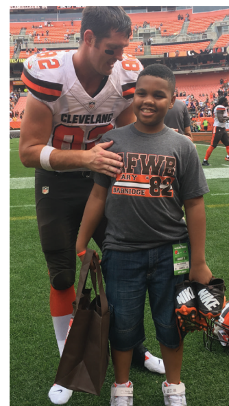
Gary Barnidge and shoe recipient