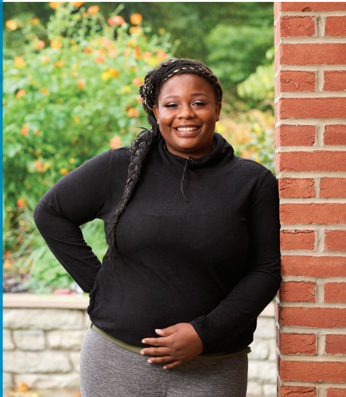
Ambrasia Addiction and Recovery Services, Columbus, Ohio