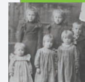
1864 The German Methodist Orphan Asylum was founded in Berea, Ohio.

The five-year, government-funded Substance Abuse and Mental Health Services Administration (SAMHSA) Treatment, Recovery, and Workforce Support Grant provides a total of $2.5 million ($500,000 per year from 2020–2025) to support the OhioGuidestone Workforce Support Program. The program serves 50 unique adult individuals each year from the Cuyahoga, Summit and Medina areas who have a gap in the workforce due to the direct prevalence of substance use disorders.