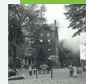
1950 Fire at main building marks switch to cottage living.