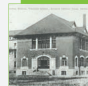
1905 The Ott Memorial Training School was built.