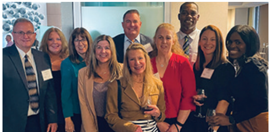
OhioGuidestone leaders at the NorthCoast 99 celebration

OhioGuidestone and the other NorthCoast 99 winners were featured in the September issue of Cleveland Magazine.